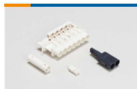
Plug & Socket Lighting Connectors(25)